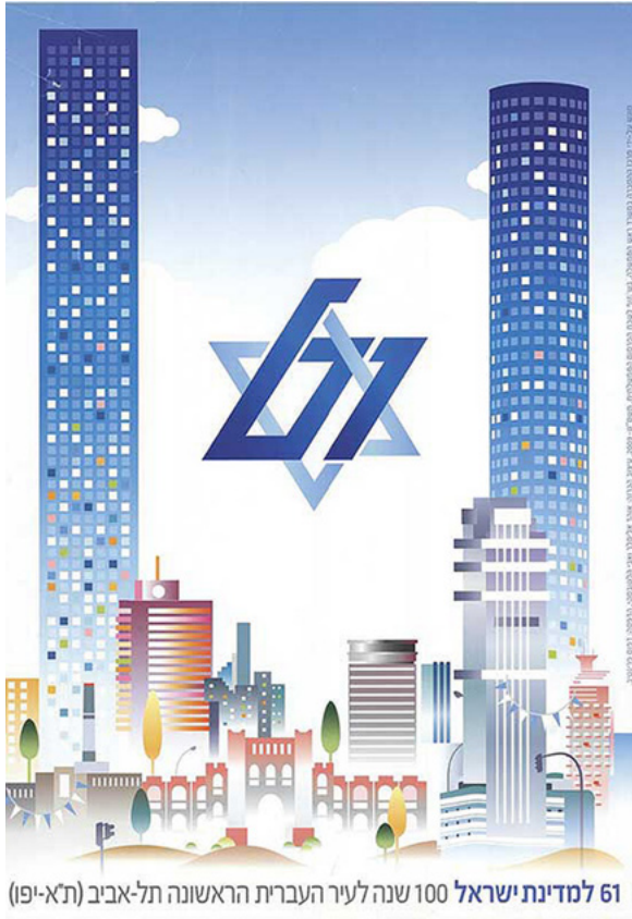
2009 Ehud Elimelech