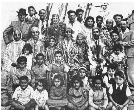
Photo of my Bukharian family, 1942.

Contemporary research shows that the resiliency of children is bolstered by their knowing family stories. Hearing stories of parents and relatives going through challenging situations is important. Jewish tradition understands the importance of revisiting core memories and sharing them. Indeed, the main mitzvah of Passover is enacting with our children our people’s foundational shared memory of the Exodus story.